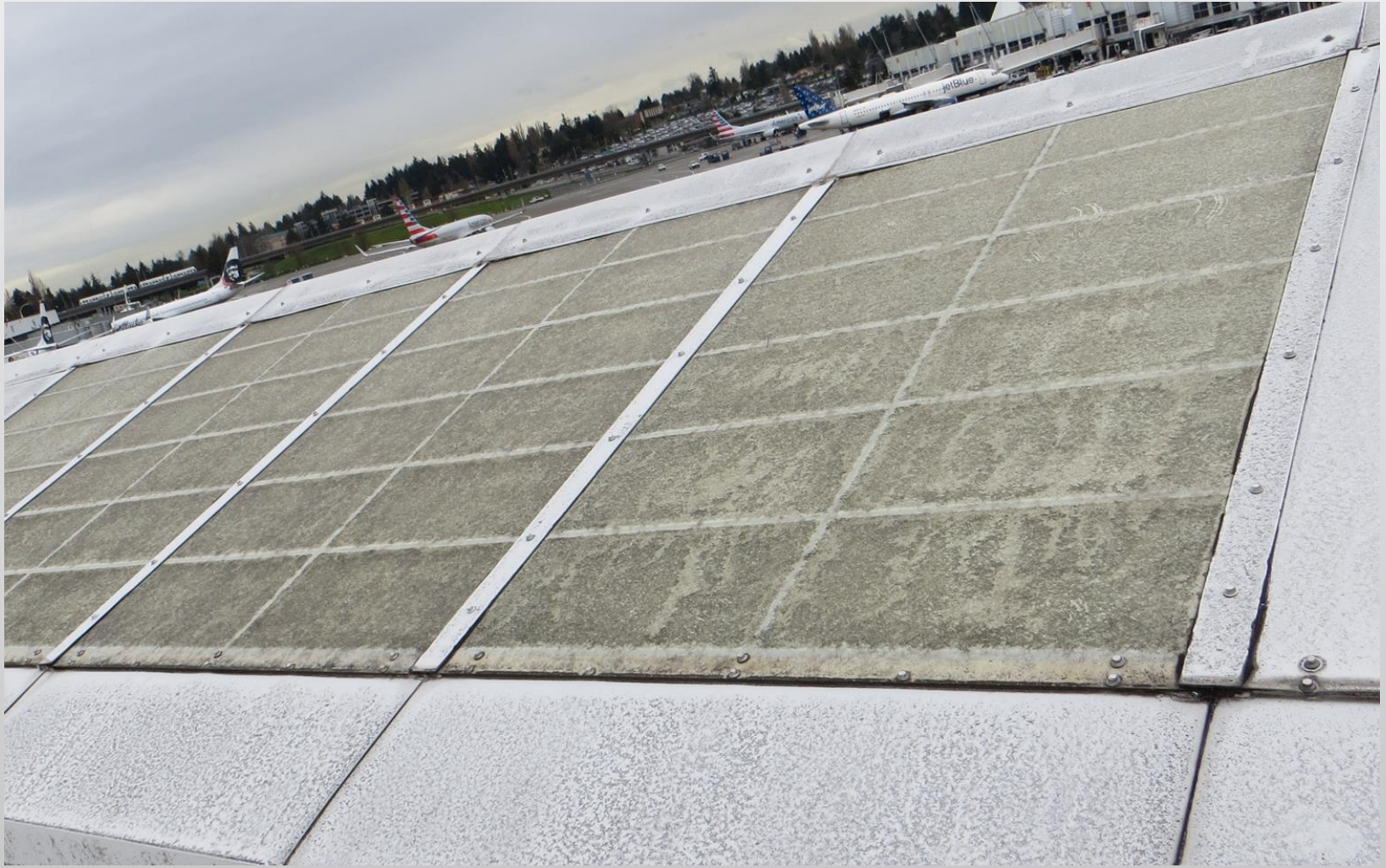
Kalwall skylight panels – beyond their useful life expectancy